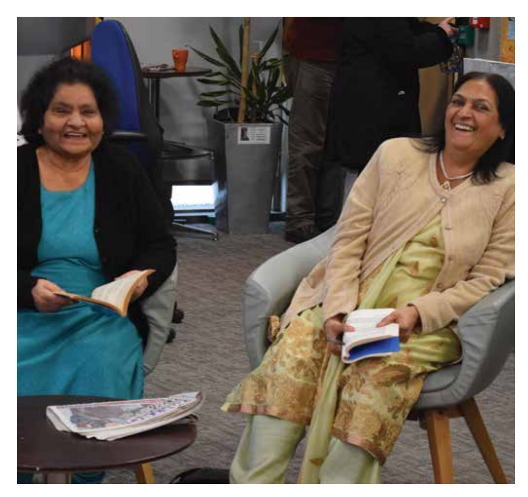
The Wellbeing Centre at Toynbee Hall, 2018